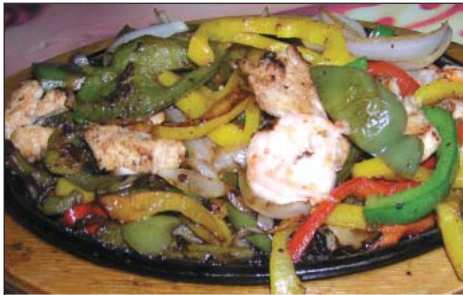
Sizzling, savory, shrimp-laden fajitas at Sonora Cantina

Simple concept, big results. In 2007 Sonora Cantina sold a whopping $15,000 for local groups and last year increased it 50% to around 23,000 tacos. Similar story in 2009, and now the second half of taco