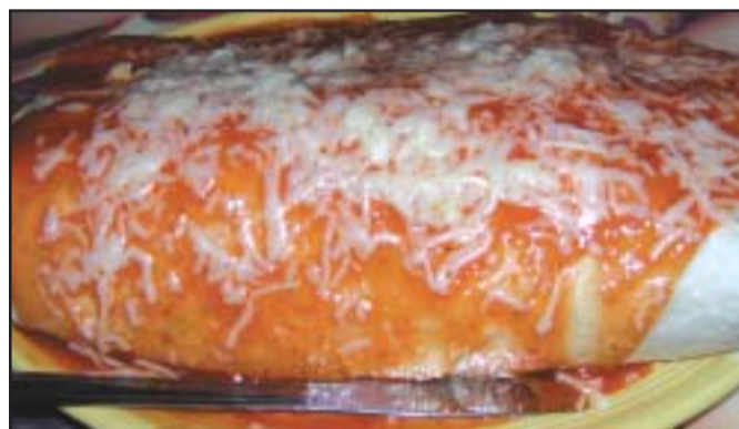
The famous Big Juan burrito fills a plate

Sonora Cantina is at 41144 Big Bear Blvd. next to Old Country Inn. 866-8202.