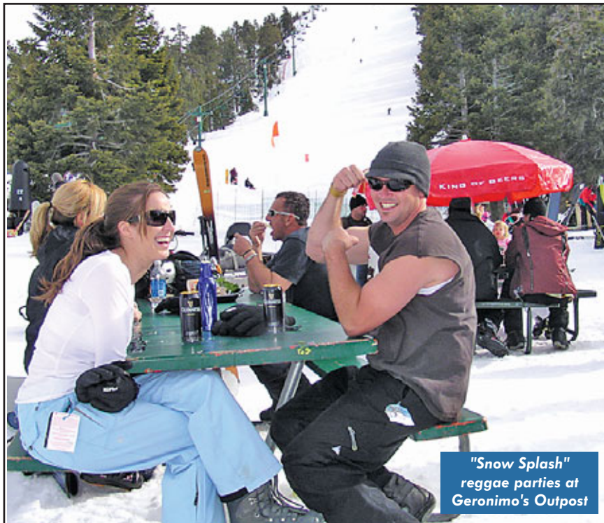
"Snow Splash" reggae parties at Geronimo's Outpost

On Bear Mountain's 13,000 sq. ft. sundeck there's always a party ready to break out, with libations from the famous Beach Bar served with a front row seat to action at America's only all-mountain freestyle park. New this year is the Tiki Bar Barbecue.