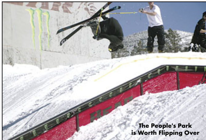
The People's Park is Worth Flipping Over

On Bear Mountain's 13,000 sq. ft. sundeck there's always a party ready to break out, with libations from the remodeled Beach Bar served with a front row seat to action at America's only all-mountain freestyle park.