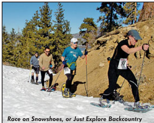
Race on Snowshoes, or Just Explore Backcountry

Big Bear Discovery Center leads snowshoe tours as well, Saturdays and Sundays beginning December 26 through March 7, plus special holiday tours on Dec. 19-20 and 28-29.